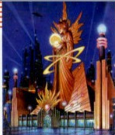
This is the arcade in the year 20XX

In the year 20XX a group of Gamers are playing the fighting game "HEROES" in an arcade in Tokio. You will join the Gamers in a match of the game "HEROES". As with live Gamers these AI characters have different fighting styles and personalities. They are the Virtual Gamers.