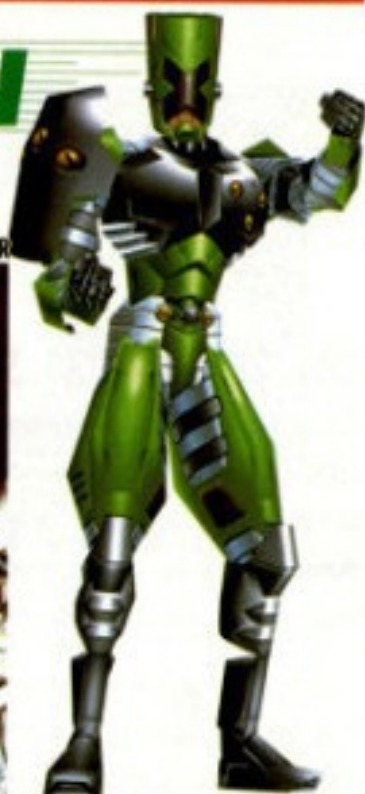
GUN EXTRA COLOR