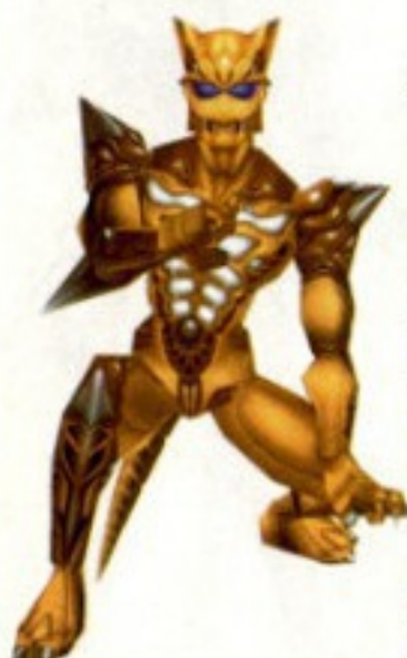
JUJIE EXTRA COLOR

Height: 177cm(181cm) Weight: 69kg Country: Floating Continent Birthday: Unknown Age: Unknown Sex: Unknown Occupation: Unknown Blood Type: Unknown Suit: Unknown