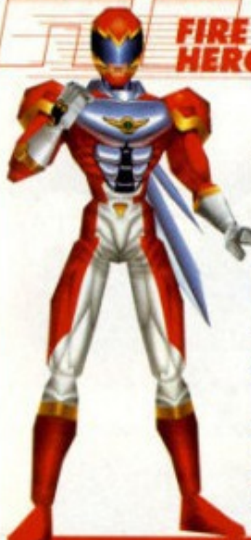
GAI EXTRA COLOR