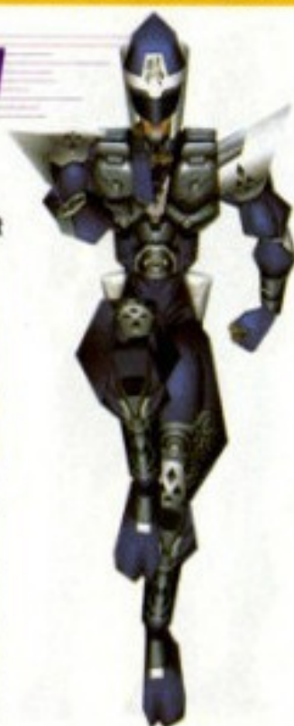
RETSU EXTRA COLOR