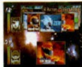
When having the Robot control your character.

Press the R Button to have the Robot control your character. The word "Robot" will appear under the Player Icon.