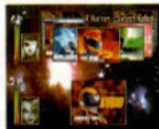
When controlling the character yourself.

The Heroes next to the Player Icon are the ones you may play. Use the Control Stick to select and press the A Button to decide.